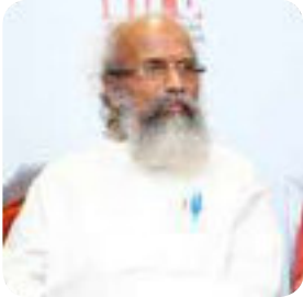
Pratap Chandra Sarangi Minister of Parliamentary Affairs and Coal & Mines