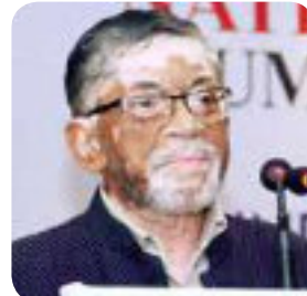
Sh. Santosh Gangwar Minister of State for Labour and Employment (Independent Charge)