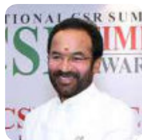
Sh. G Kishan Reddy Minister of State for Home Affairs