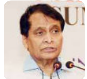
Sh. Suresh Prabhu Member of Parliament (frm. Union Minister)