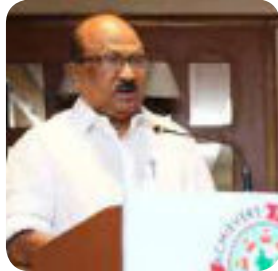
Prof. K. V. Thomas Member of Parliament, & Former Union Minister