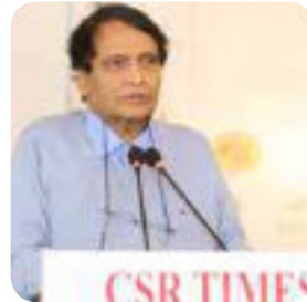
Shri Suresh Prabhu Union Minister of Commerce & Industry and Civil Aviation