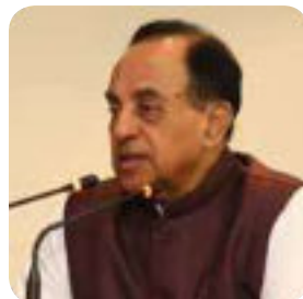
Dr. Subramanian Swamy Member of Parliament,