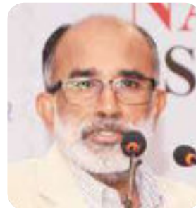
Sh. K.J. Alphons Member of Parliament (frm. Union Minister)