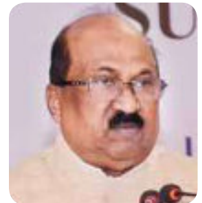
Dr. K.V. Thomas Member of Parliament (frm. Union Minister)