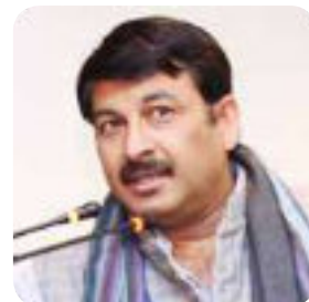
Sh. Manoj Tiwari Member of Parliament,