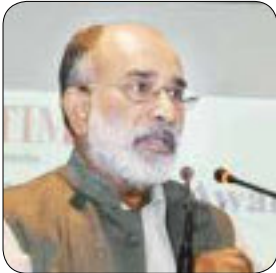
Sh. K.J. Alphons Union Minister of State (IC) for Ministry of Tourism