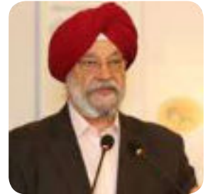
Shri Hardeep Singh Puri Union Minister of State (IC) for Housing and Urban Affairs