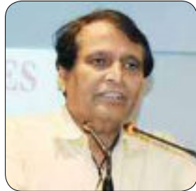
Sh. Suresh Prabhu Union Minister of Comm. Industry & Civil Aviation