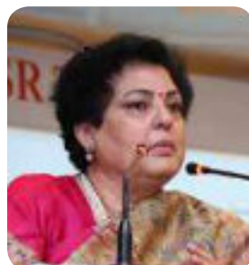
Ms Rekha Sharma Chairperson, National Commission for Women